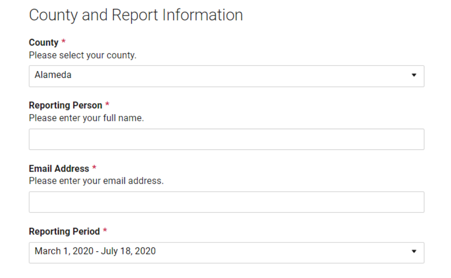
Figure 7. "County and Report Information" section.

Figure 7 provides a snapshot of the County and Report Information Section.