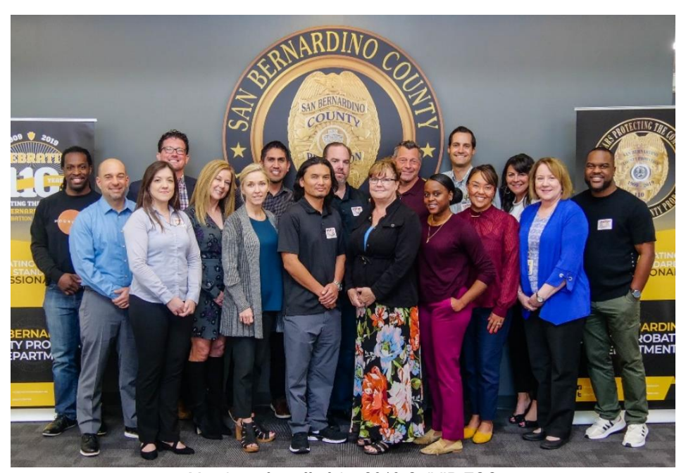
Members & staff of the 2019 CalVIP ESC

The CalVIP ESC includes a cross-section of subject matter experts on community engagement, prevention and intervention programs, law enforcement strategies, and rehabilitation and reentry, including individuals who have been impacted by the criminal justice system. A list of CalVIP ESC members can be found in Appendix C .