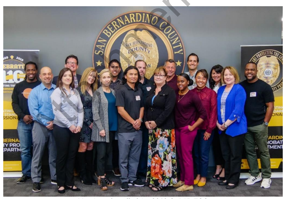
Members & staff of the 2019 CalVIP ESC

The CalVIP ESC includes a cross-section of subject matter experts on community engagement, prevention and intervention programs, law enforcement strategies, and rehabilitation and reentry, including individuals who have been impacted by the criminal justice system. A list of CalVIP ESC members can be found in Appendix C .